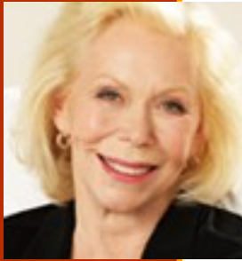
Louise L Hay